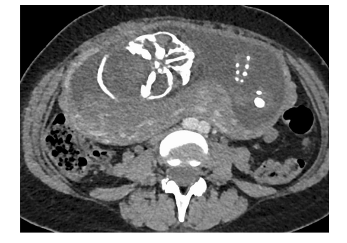
Fig. 2 Compression of the interior vena cava by the uterus and fetus

The aortic root was dilated in a pyriform manner. Blood was delivered to the ascending aorta in the non-dissected area by the Seldinger method, and extracorporeal circulation was established with blood removal from the right atrium via two tubes. A left ventricular vent was inserted, and the ascending aorta was occluded when ventricular fibrillation occurred. The ascending aorta was dissected, and cardiac arrest was caused by selective antegrade injection of cardioplegic solution. The central temperature was cooled to 20 °C